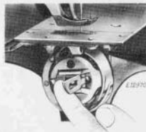
Fig. 9. Removing the Bobbin

Draw out the slide in the bed of the machine, reach down with the thumb and forefinger of the left hand, open the bobbin case